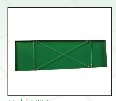
Model # 30 Tray Designed to fit under our 30LTD & 30D traps. 4 bungie cords attach the tray to the underside of our traps or carriers to keep things together when moving.